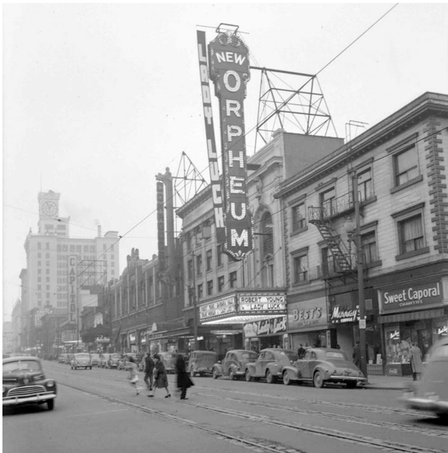
Graville St.