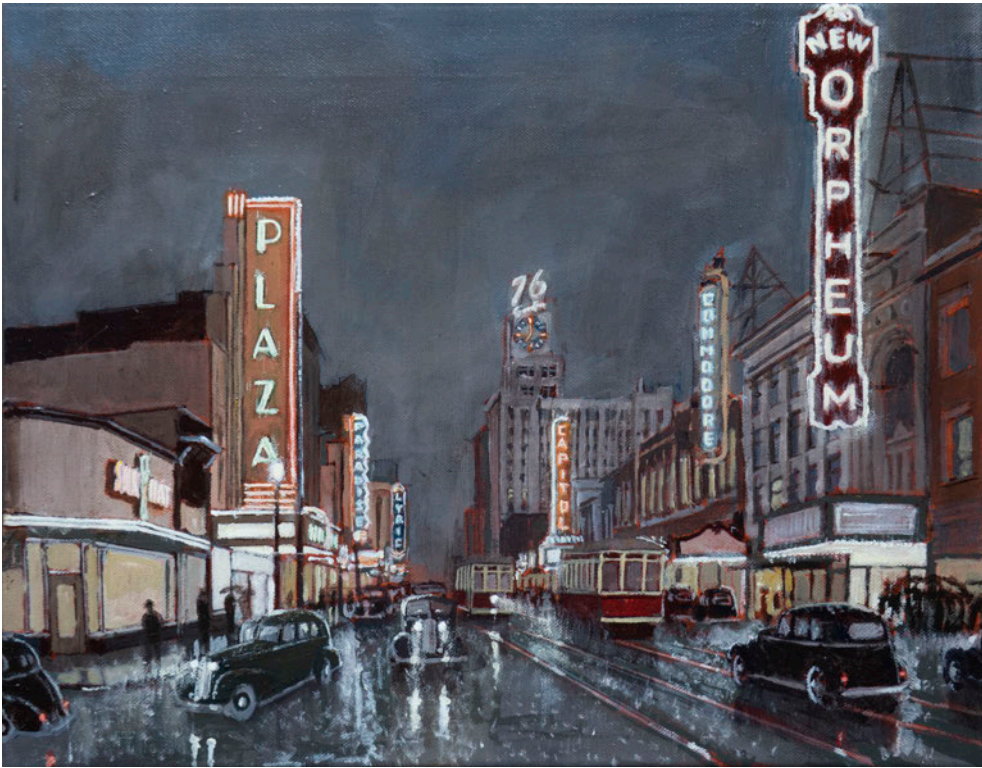
Theatre Row 1940 - Autumn Night acrylic on canvas 14" x 18"