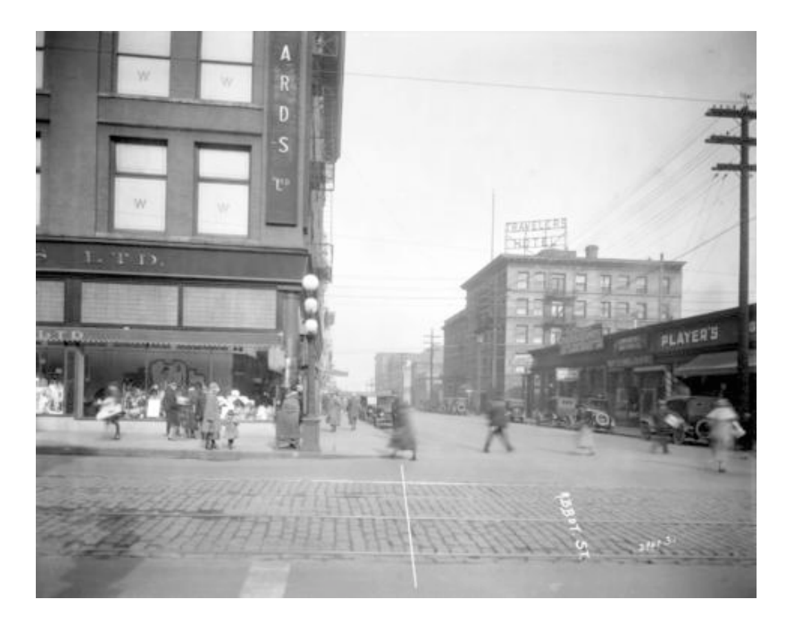
Abbott St. looking north from Hastings St.