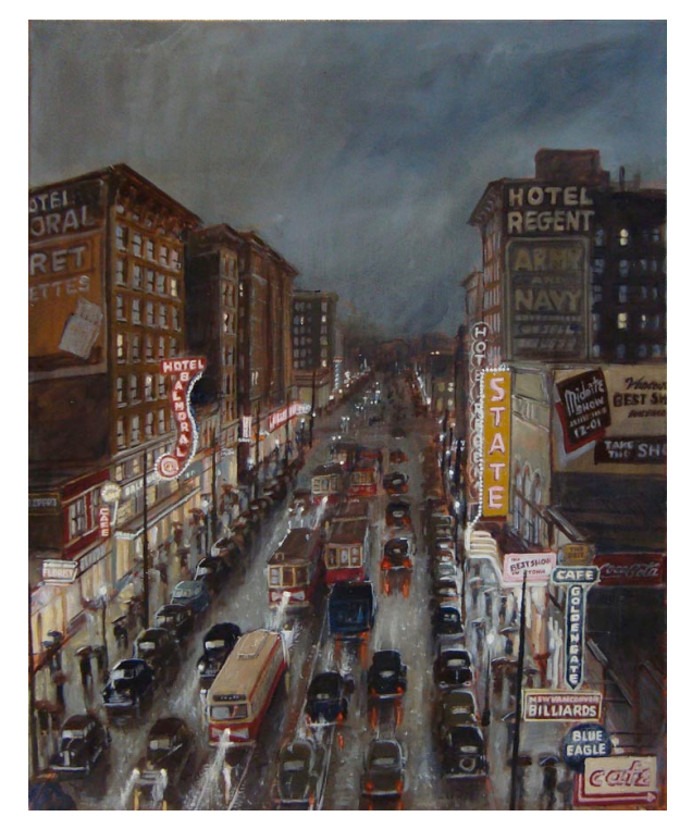
above - Confidential proposal looking eastward

for further information, framing options or to arrange a personal viewing, please contact Tom Carter: tom@tomcartergallery,com